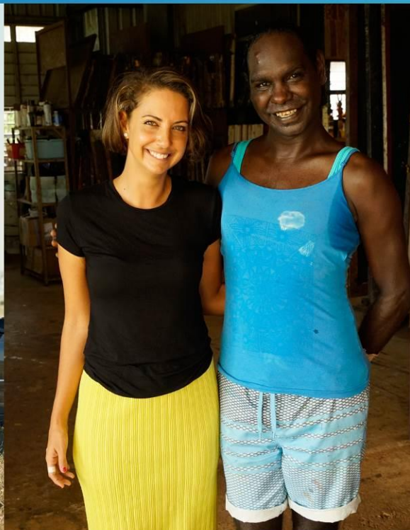
BACK ROADS Monday 23 July 8.00pm