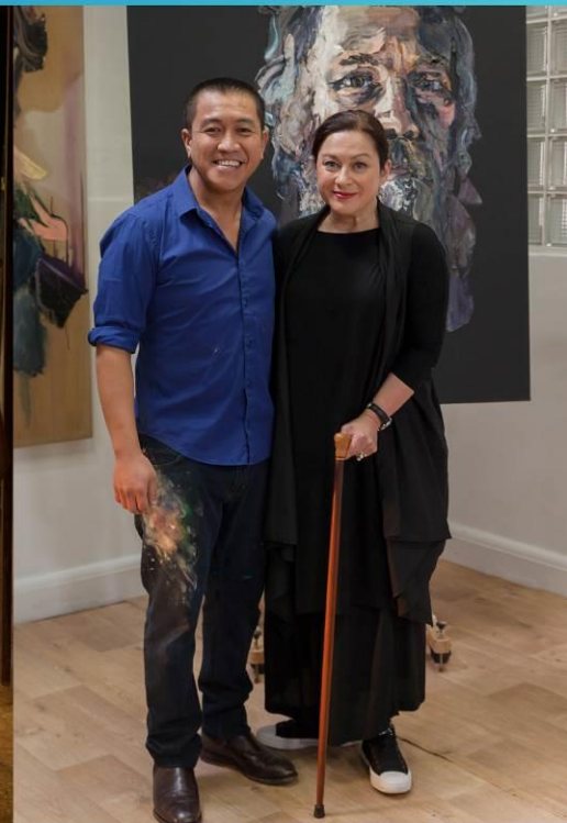
ANH'S BRUSH WITH FAME Wednesday 25 July 8.00pm