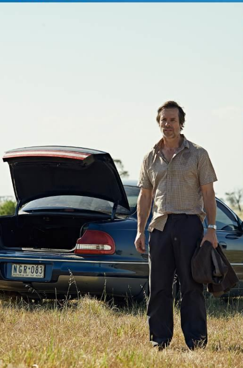
JACK IRISH Sunday 22 July 8.30pm